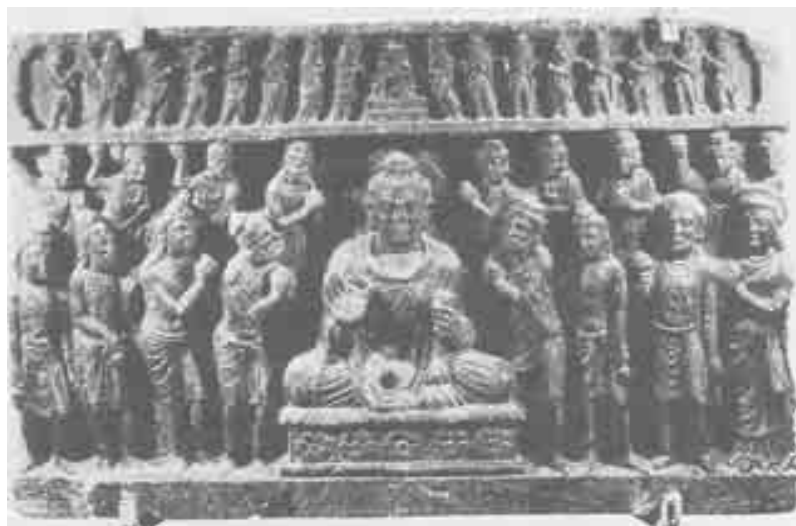
Shotorak Schist, 2 nd – 5 th Century A.D

Soon after the Saur Revolution, by order of the Ministry of Defense of the Democratic Republic of Afghanistan, the contents of the Kabul Museum were shifted in 1979 from Darulaman to the large, and by then deserted house of Mohammed Naim, Sardar Daoud's Brother, near the French Embassy in Wazir Akbar Khan. The museum building in Darulaman was turned into an annex to the Ministry of Defense in Darulaman Palace as the whole area became a military zone.