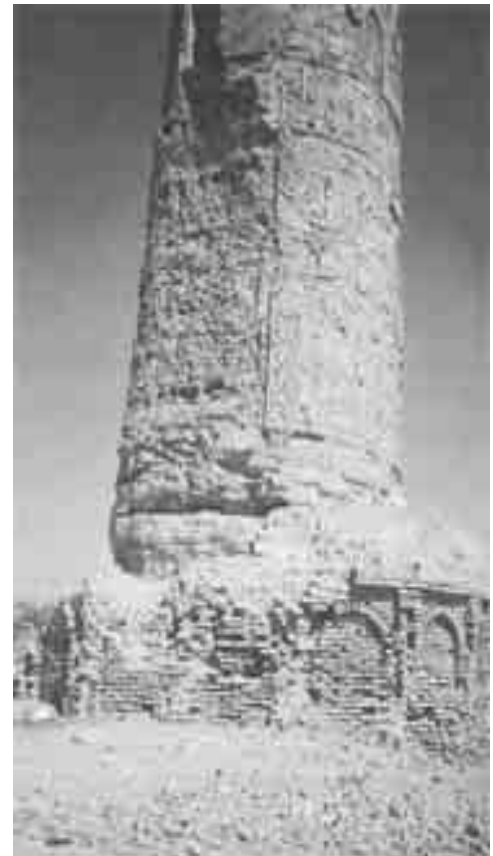
Inclination/deterioration point of the minaret