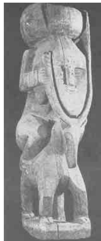
Grave Effigy, Nuristan 19 th Century