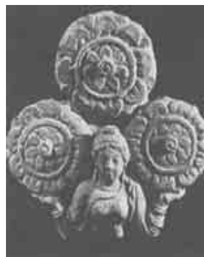
Hadda, 2 th -7 th Century A.D