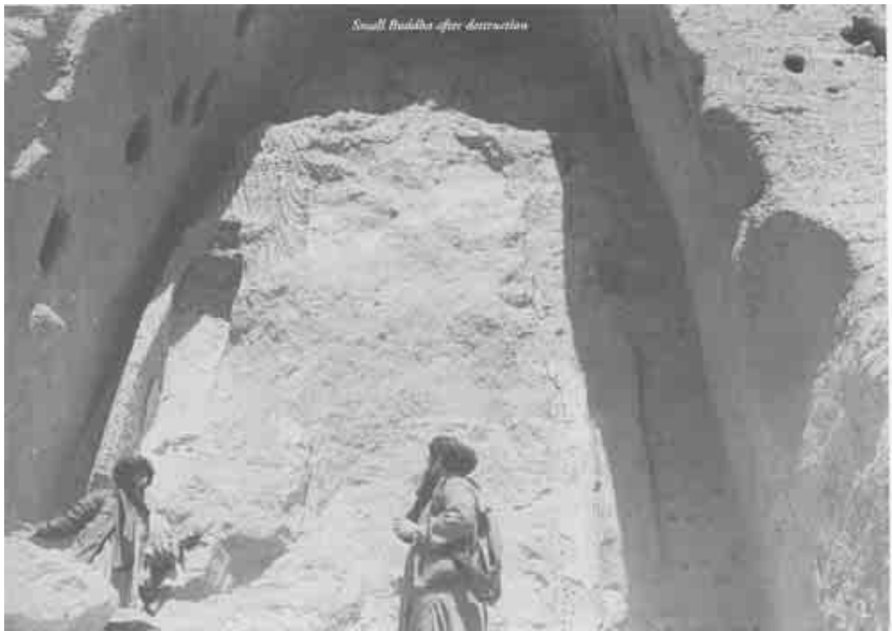
March 2001