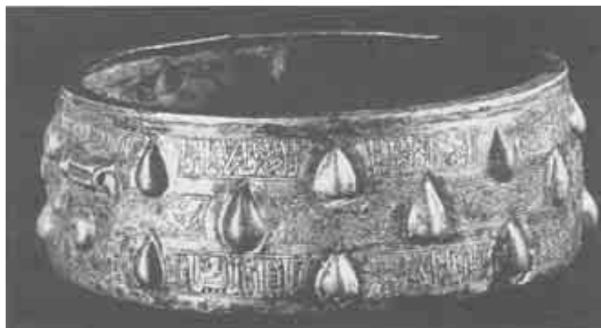
Ghaznavid bronze, 10 th -12 th Century A.D.