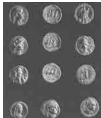
Silver coins from the Kunduz Hoard, 1 st B.C.

These tragic years saw the devastation of Kabul, as well as the Museum in Darulaman, exposed as it was on the front line. Looting began in 1993, when the area was isolated by the fighting and the museum staff were unable to reach Darulaman for months at a time. Every time the area changed hands there was further looting. In May 1993 the museum building was shelled, the roof and top floor destroyed and left open to the elements. In early 1994 UNCHS (United Nations Centre for Human Settlements) weatherproofed the top floor, installed steel doors on all the lower storerooms, and bricked up windows. More than 3,000 objects were painstakingly rescued from the rubble. Yet looting continues.