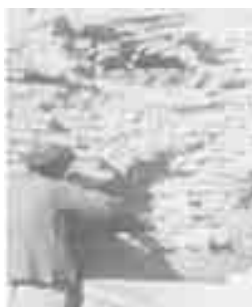
© G. Naqshband Rajabi Dec 2000

The huge central dome, which was severely damaged by rocket attacks during the years of conflict, had a large hole of approximately 2.5 square meters. This was repaired, as well as the eastern arch, which was 40% destroyed. The old retaining wall close to the external curve of the arch was reconstructed. The Four Corners around the central dome had lost 80 cubic centimeters of their concrete format. All these damaged areas have been properly repaired. The surface of the entire roof was covered with a 3-cm thick straw-mud layer. The southern 'tower' of the mausoleum also had holes in various parts of its structure including the shaft. A two cubic meters hole was repaired. The water outlets on the roof had not been maintained for years and one of the main outlets was missing. Five white marble passages were replaced in the original locations. Remains of ruins and the destroyed walls and inner portion of the dome were cleaned, removed and replaced with materials matching the original structure. Over 100 square meters of the internal plaster which had peeled-off were skillfully repaired. Some 30 missing doors and windows of high quality white wood were re-installed in January this year.